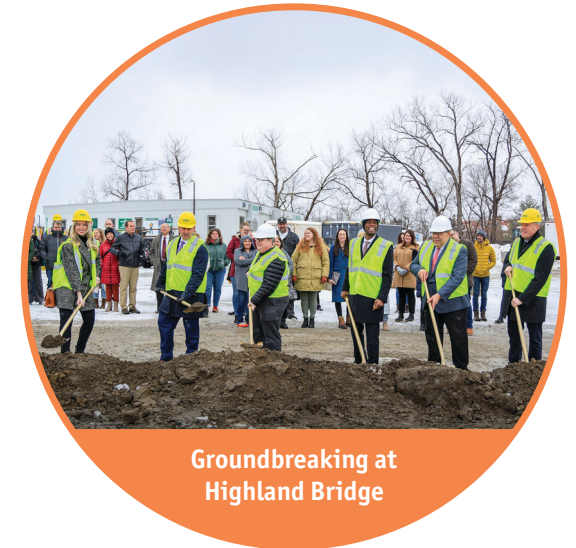
Groundbreaking at Highland Bridge

Engaging diverse community members, organizations, and businesses fosters collective ownership and direct benefits within the real estate development process.