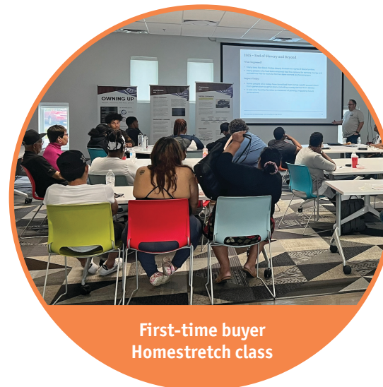
First-time buyer Homestretch class

Creative approaches and systems change to resist gentrification and offer people quality, affordable choices to stay in their community.