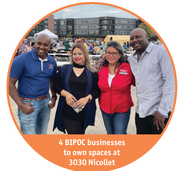
4 BIPOC businesses to own spaces at 3030 Nicollet

Focusing commitments and investments in community capacity in a neighborhood connects PPL's people- and place-based strategies.