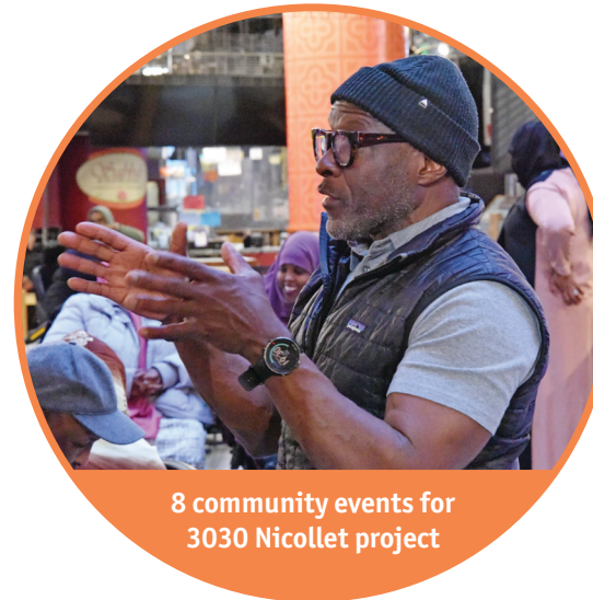
8 community events for 3030 Nicollet project

Elevating the unique identities, perspectives, and experiences of individuals and groups within a community leads to richer and more effective decision-making and outcomes.